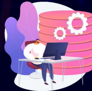
Database Apps Library Management System