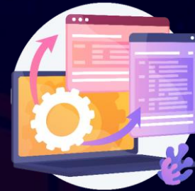
Dashboard & Reporting